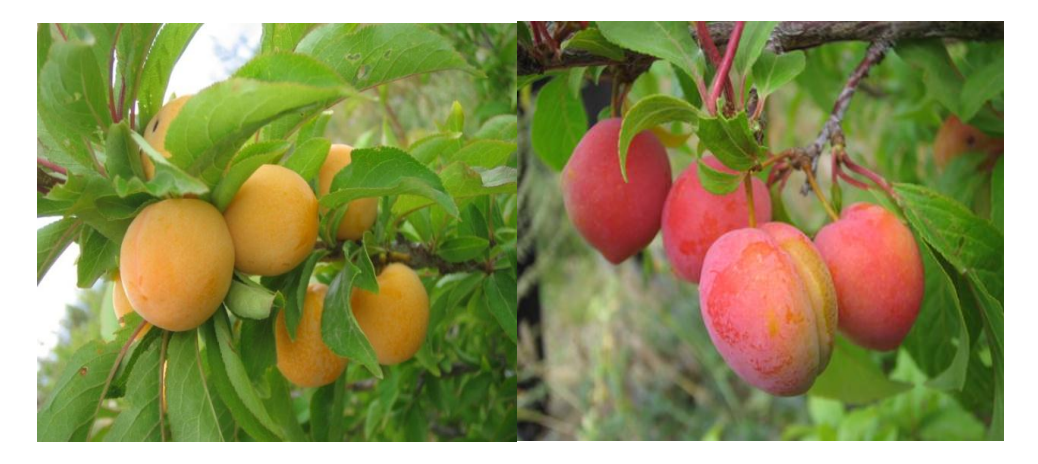
Алыча Колонновидная Алыча МК 2