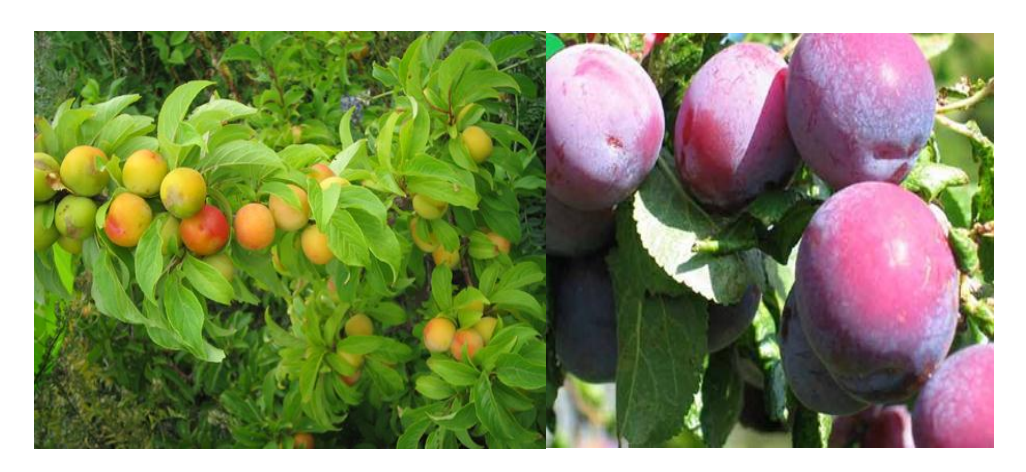
Алыча МК 1