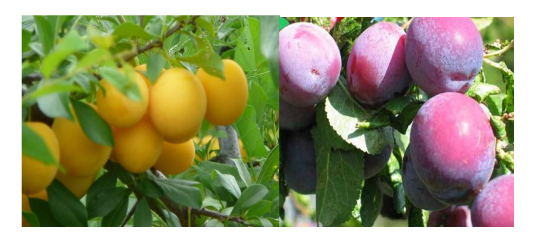
Сорт Жёлтая хопти