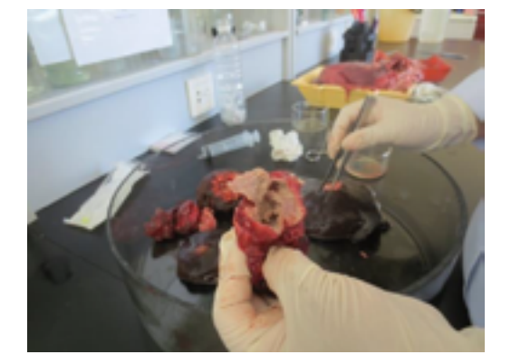
Figure 2. Calcified cyst in lung of camel