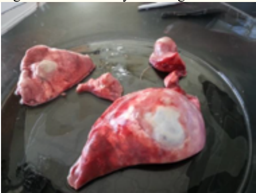
Figure 4. Echinococal cysts in lung of camel

liver were noticed (Figure 6). In lungs, there was proliferation of fibrous connective tissue and infiltration of mononuclear cells (Figure 5).