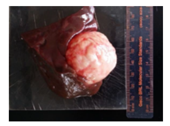
Figure 1. Echinococcal cyst in liver of camel