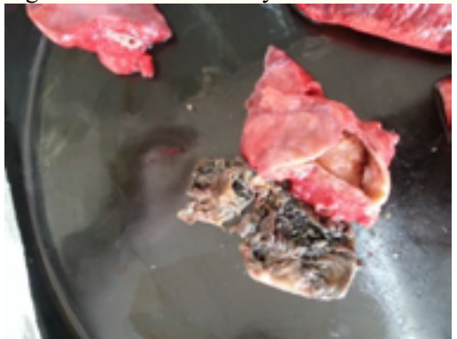
Figure 3. Sterile cyst in lung of camel

The cysts were surrounded by outer fibrous layer over the inner germinal layer and filled with clear hydatid fluid. Histologically, leucocyte infiltration and mild hepatocellular degeneration and infiltration in the