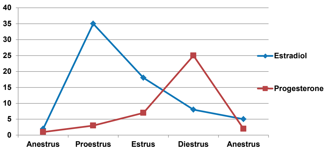
Picture 1. Diagram of canine sex hormone changes

Changes of canine sex hormone, progesterone and estradiol concentrations during these stages were shown in the diagram 1.