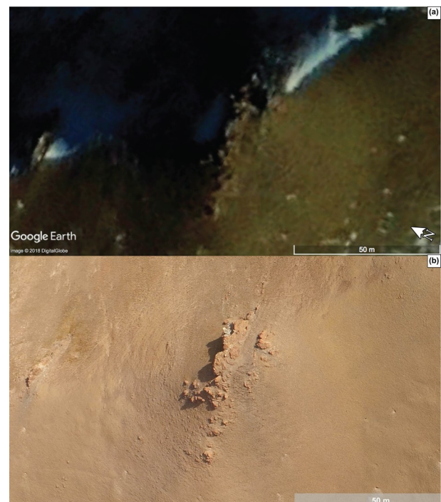
Figure 2. Comparison between Google Earth Imagery and drone image. a Google Earth Imagery shows low resolution and is affected by sun's angle. b drone image in the Altai area. The outcrops are clearly shown.

Two drone images were taken from two areas (Fig.1 c and d). In the Altai area, one part of ultramafic body (the Naran massif: 0.07 km 2 area) was investigated (Fig.1c). Figure 2 shows comparison between Google Earth Imagery and drone image. Google Earth Imagery shows low resolution and has shadow (Fig.2a). Drone yields image with high resolution and we can see outcrop of ultramafic rocks in summit of mountain (Fig.2b). In the Chandman area (0.08 km 2 area), boundary between the eclogite and limestone was investigated (Fig.1d).