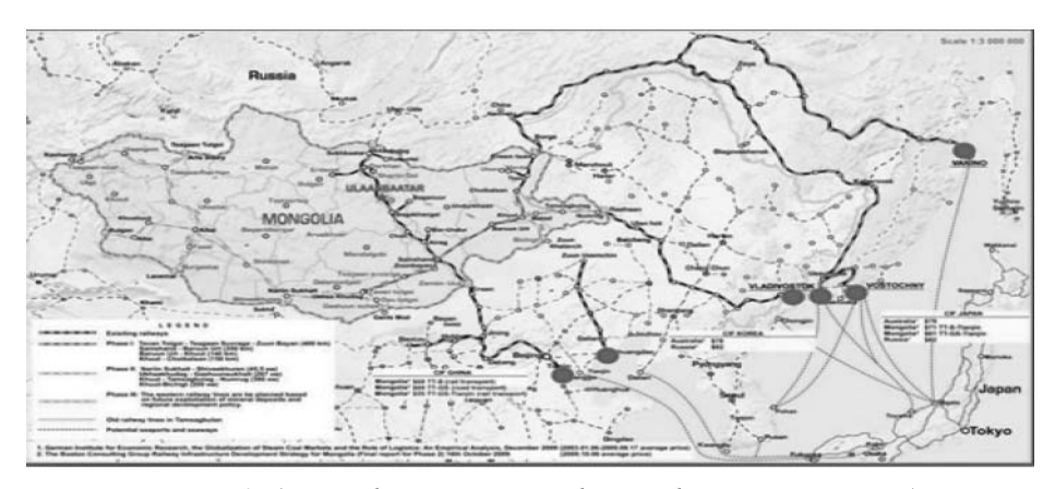
Figure 1. (Mongolia transit corridors and access to seaport)

In the Northern Asia, there are two major road traffic lines linking Asia and Europe, namely Trans-Siberian Railway/ Highway, and New Euro-Asia Railway/ Highway (See Figure 1-2). The former one linked China with Europe, via Russia and Mongolia (the part in Mongolia is oriented north and south, which is 1,110 kilometers in length), while the later one linked China with Europe, via Russia and Kazakhstan.